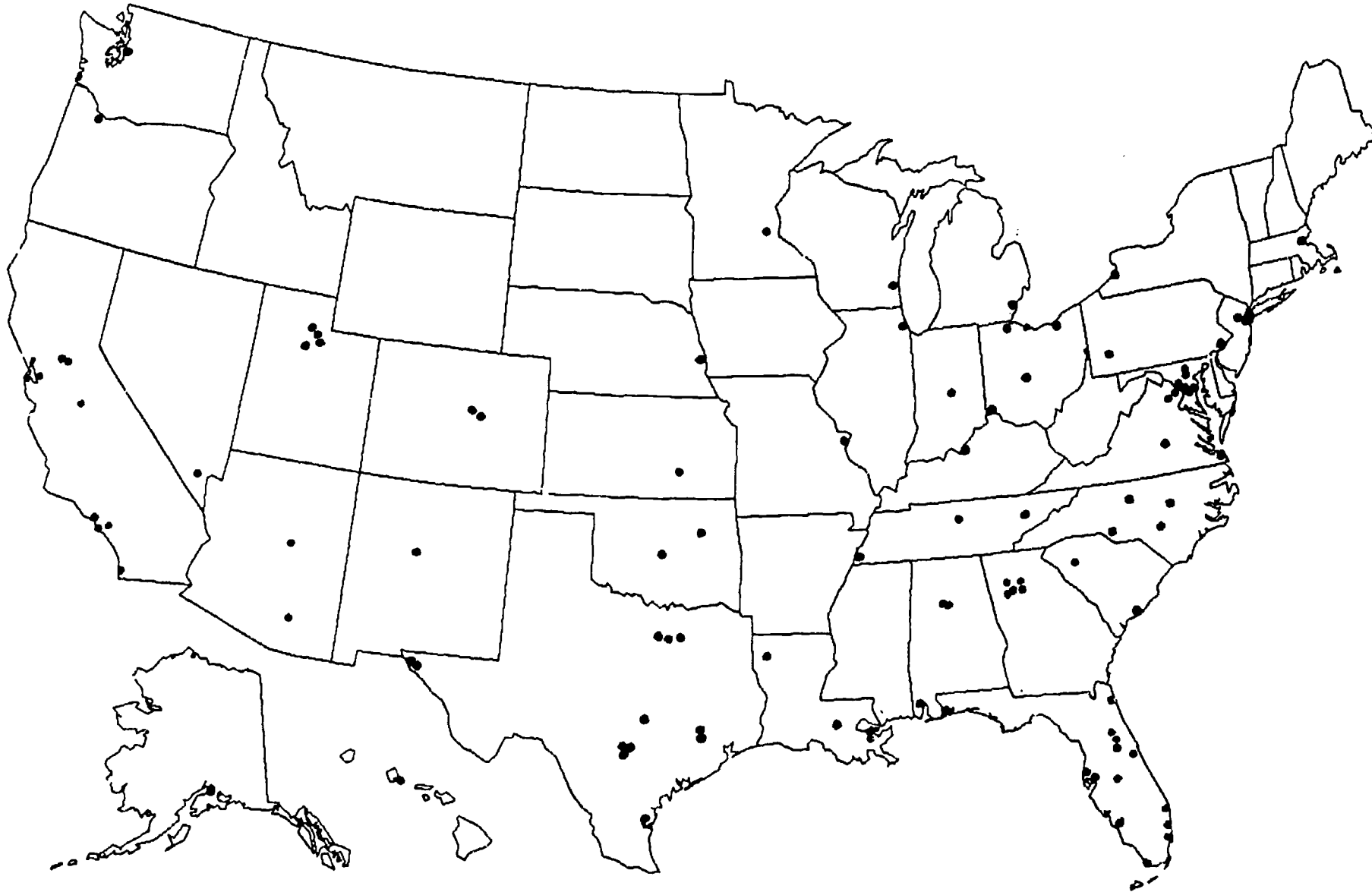
Figure 2.—Location of 100 largest school districts in the United States