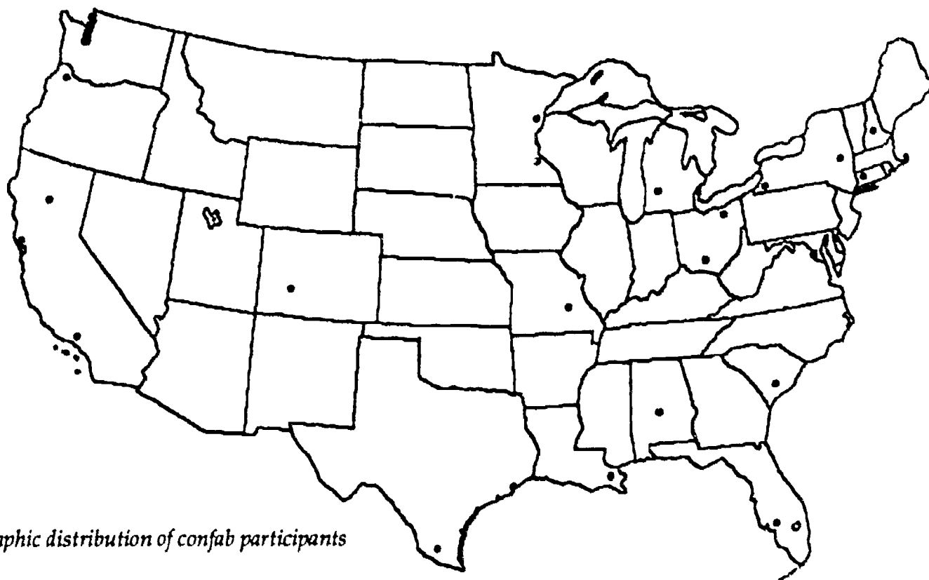
Geographic distribution of confab participants