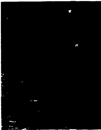
Light Rail in Downtown San Jose

Located midway between San Francisco and San Jose on the San Francisco Peninsula, Los Altos Hills offers a wide variety of recreational opportunities and cultural attractions in the heart of Silicon Valley. The multiethnic mix in the San Francisco Bay Area blends many heritages — Asian, Middle Eastern, Latin American, African and European.