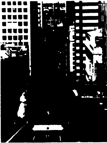
California Street Cable Car