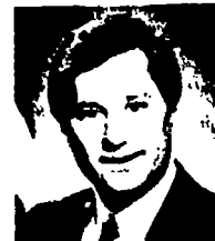
James J. Blanchard Governor