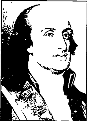
John Jay.

JOHN JAY , at forty-two, was the oldest of the three authors. A New Yorker, he had served his state and nation as principal author of the state constitution, member of a delegation that negotiated the Treaty of Paris (1783) to officially end the War of Independence, and head of foreign affairs under the Articles of Confederation. In 1789, Jay became the first Chief Justice of the United States.