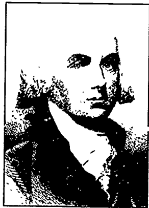
James Madison.

JAMES MADISON of Montpelier, Virginia was thirty-six years old in 1787 and had been among the most prominent leaders in the Federal Convention. Later, he was called "father of the Constitution" because of the great part he played in shaping the Constitution. In 1789, Madison became a Representative from Virginia to the first session of Congress under the Constitution; he proposed amendments that, following deliberation and modification, became the Federal Bill of Rights. He later served as Secretary of State under President Thomas Jefferson and as fourth President of the United States.