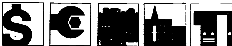
Table 1. Key Characteristics of State Work/Welfare Initiatives