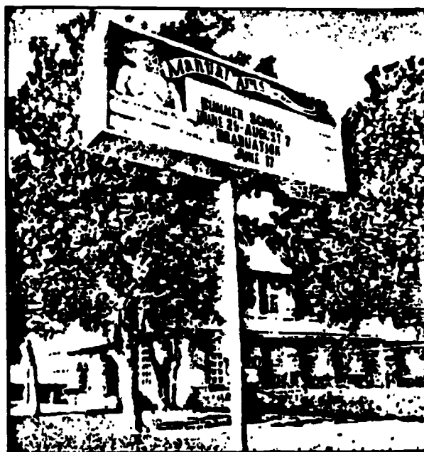
BUCK MEYER / Los Angeles Times

At Manual Arts High School, only 11 of approximately 1,200 male students went out for the basketball team.