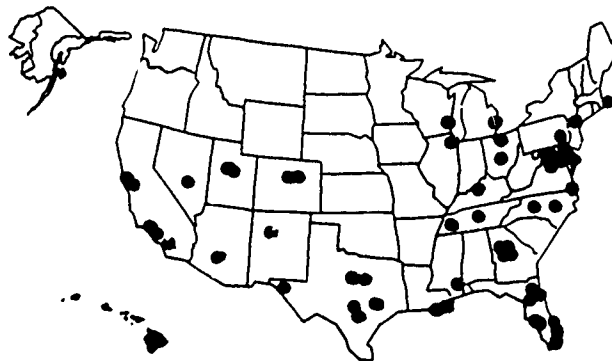
Figure 3.--Location of the 55 largest school districts in the United States: School year 1987-88