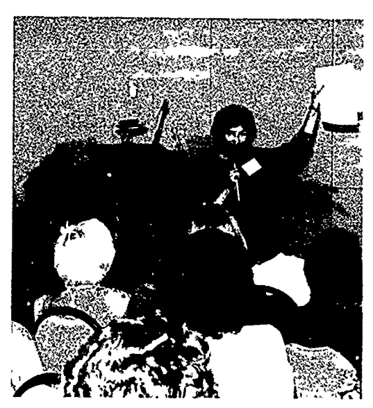
Organizations are providing resources for Forums

The 1989-1990 NIF issues were introduced at NF '89 in a session hosted by the Congressional Institute for the Future.