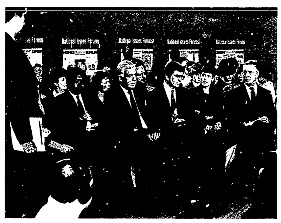
Congressional leaders and citizens evaluate our democracy

Key congressional members and national opinion leaders joined NIF participants at the National Press Club during National Forums '89 for a lively discussion of the condition of our democracy and the roles of elected representatives and citizens in the democratic process. The occasion, billed as a discussion of "How Is Our Democracy Doing?" was the National Forums' first-ever National Town Meeting, a national political discussion in the form of an eld-fashioned town meeting.