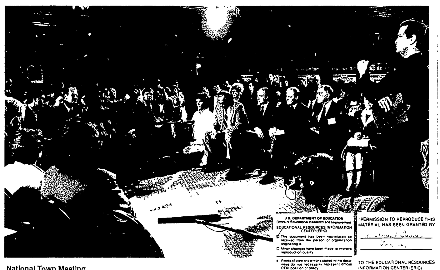
National Town Meeting

Nearly 300 National Issues Forums participants from across the nation gathered in Washington, D.C. April 16 through 19 for National Forums '69, the culminating event of the National Issues Forums 1988-1989 cycle.