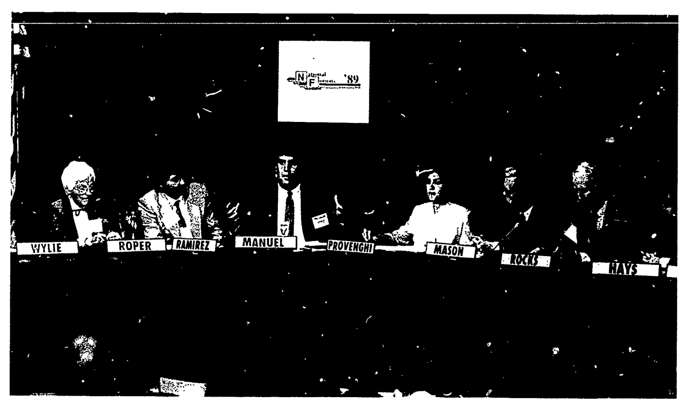
NIF convenors report Forum results to policymakers

Executive Branch policymakers who work in areas concerned with each of the 1988-1989 NIF issues joined convenors from six communities in a panel discussion hosted by the White House Office of Domestic Policy at the Old Executive Office Building. They heard not only outcomes of Forums on each issue, but also the deliberations that led participants to their conclusions.