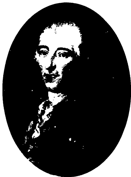
Miniature by unknown artist, of unknown date

a position that carried the rank of brigadier general, although he continued to prefer to be addressed as major, his highest combat rank.