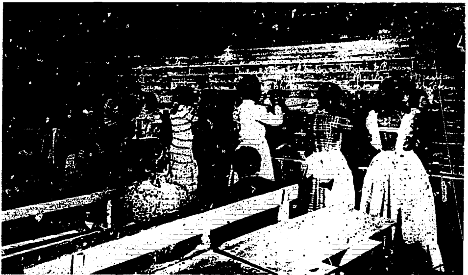
Kowalliga (ALA) School, 1909.