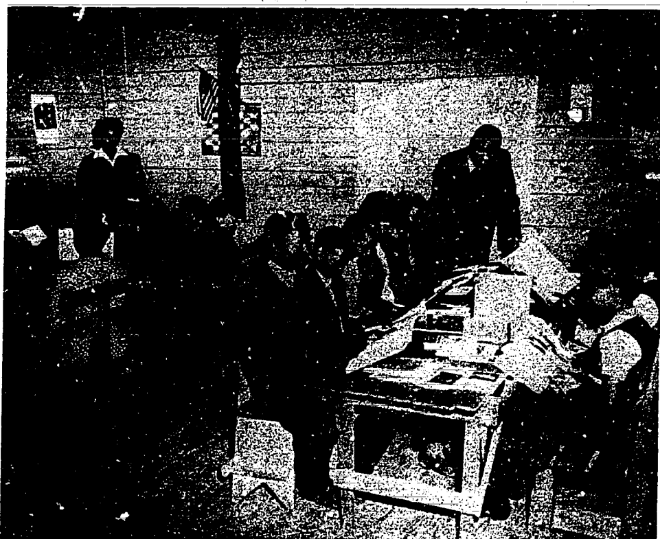
New Hope (MISS) School Map Study, c. 1949. Visiting teacher on right and regular teacher on left.

teacher had less than six months of such training. 13 The latter was described this way: