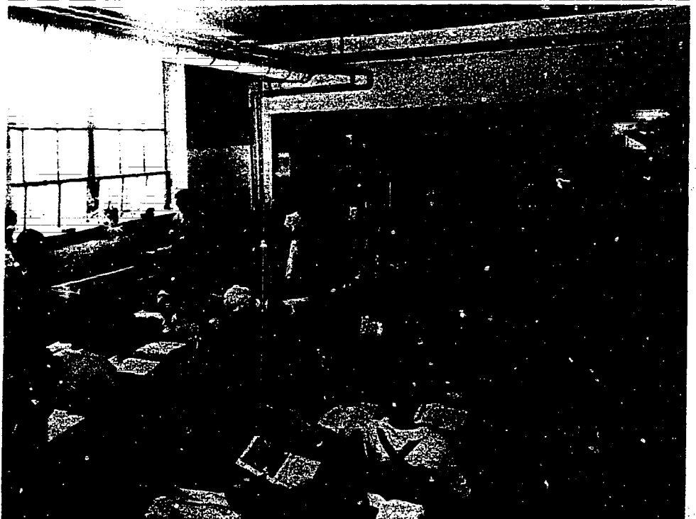
Flak University summer school curriculum laboratory for negro teachers and administrators, grades 4-6, c. 1936.

Most blacks, however, lived in the rural South and away from Tuskegee, and the prospect of a rural black girl's receiving a quality elementary education was not bright. As late as 1927, 93.4% of black schools were rural, and 63.8% of those had only one room. 12 Buildings were frequently wooden and lacked plumbing. Black teachers were generally less prepared than white ones, especially in the rural areas. A black teacher in the city averaged two and a half years of training beyond high school, but the average rural