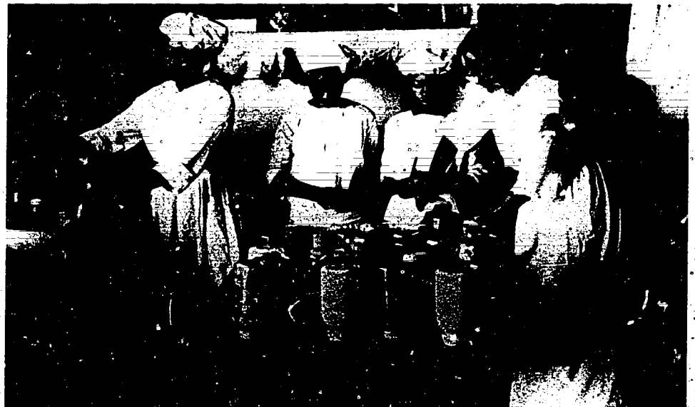
Alabama Homemakers' Clubs, c. 1917.

Morality and racism permeated a curriculum that mixed the 3 R's and practical training. Schoolbooks and domestic and vocational science subtly taught about the sanctity of the home and the need for blacks to adjust to a second-class citizenship. Although educators and industrialists were pleased to offer blacks an education that would improve their home life and living conditions, they had no intention of encouraging any alterations to the underlying economic and social structure of the region. They also had no intention of altering traditional sex roles. Therefore, for education to be appropriate, it had to be relevant to sex as well as race. The result was that black boys were generally taught elementary agricultural skills, while girls learned domestic ones. For both groups, work habits and morality were stressed.