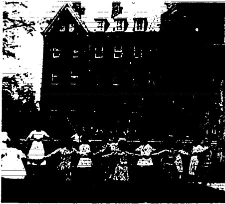
Children play at the Model School at Spelman College.