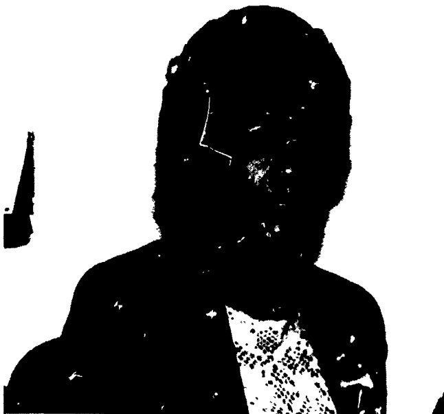
Service Employees International Union (SEIU)