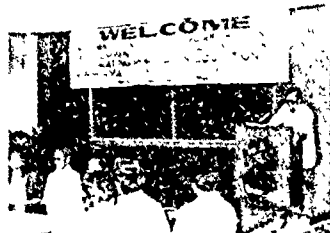
Curriculum Development in Population Education in the Non-Formal Education System