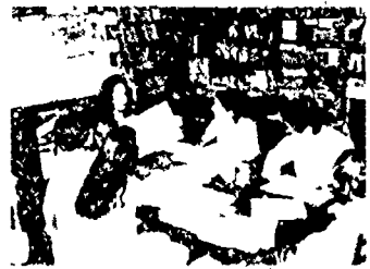
Research and Evaluation in Curriculum Development