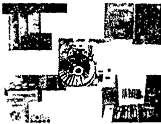
State-of-the-Art on Curriculum Development in Population Education