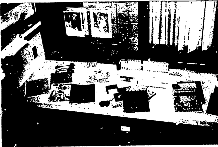
Native Studies Curriculum Resources developed by LIP workers, University of Saskatchewan at Saskatoon.