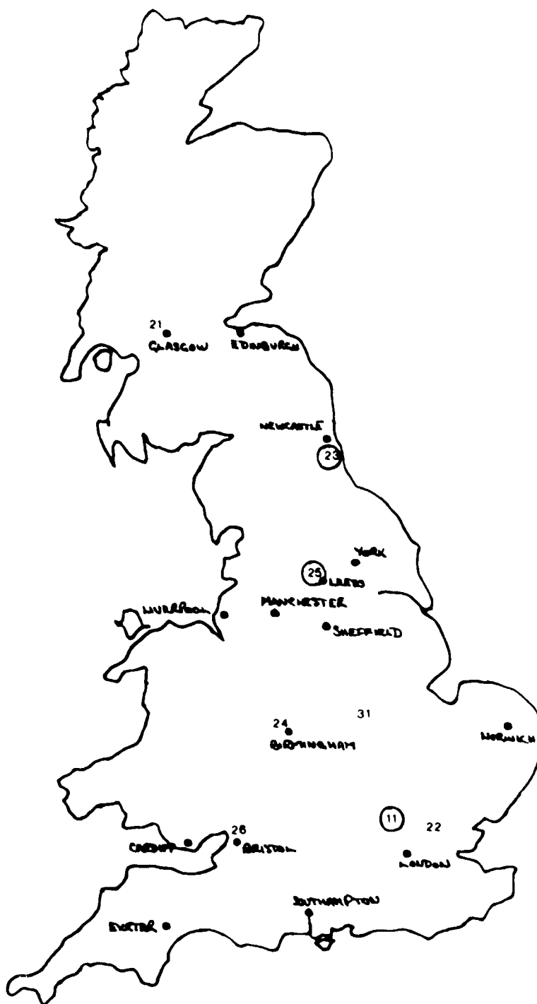
Figure 1 Numbers relate to those in the Register; in each case the first digit indicates the relevant section. Circled numbers indicate exercises connected with CNA validation procedures.