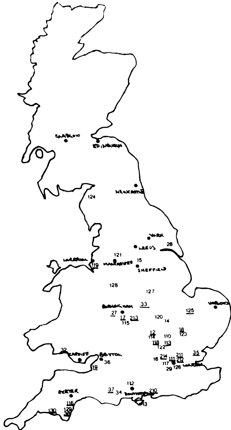
Figure 2 Numbers relate to those in the Register; in each case the first digit indicates the relevant section. Numbers which are underlined indicate exercises linked with INSET providers.