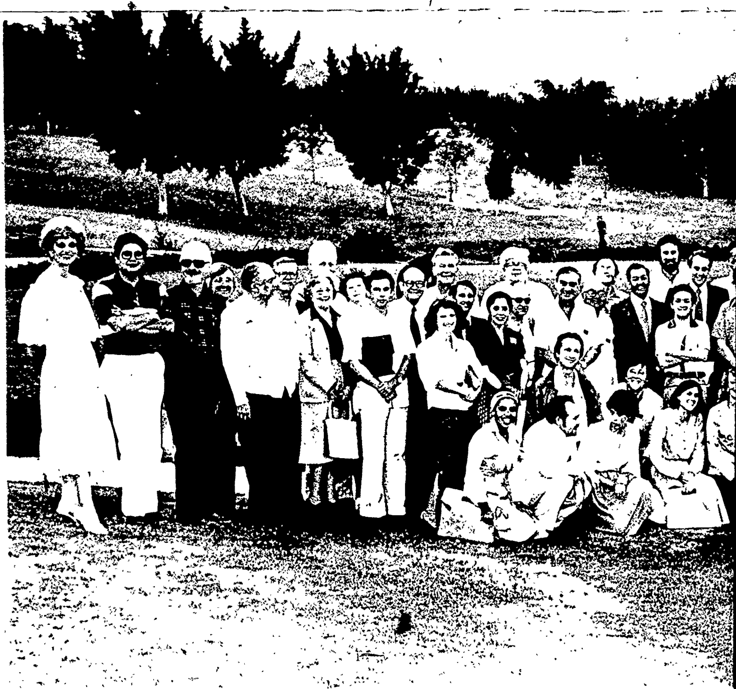
Participants in the Second United States Mexico Communication Media Symposium. Photograph taken following a luncheon at the Tabachines Golf Club in Cuernavaca.