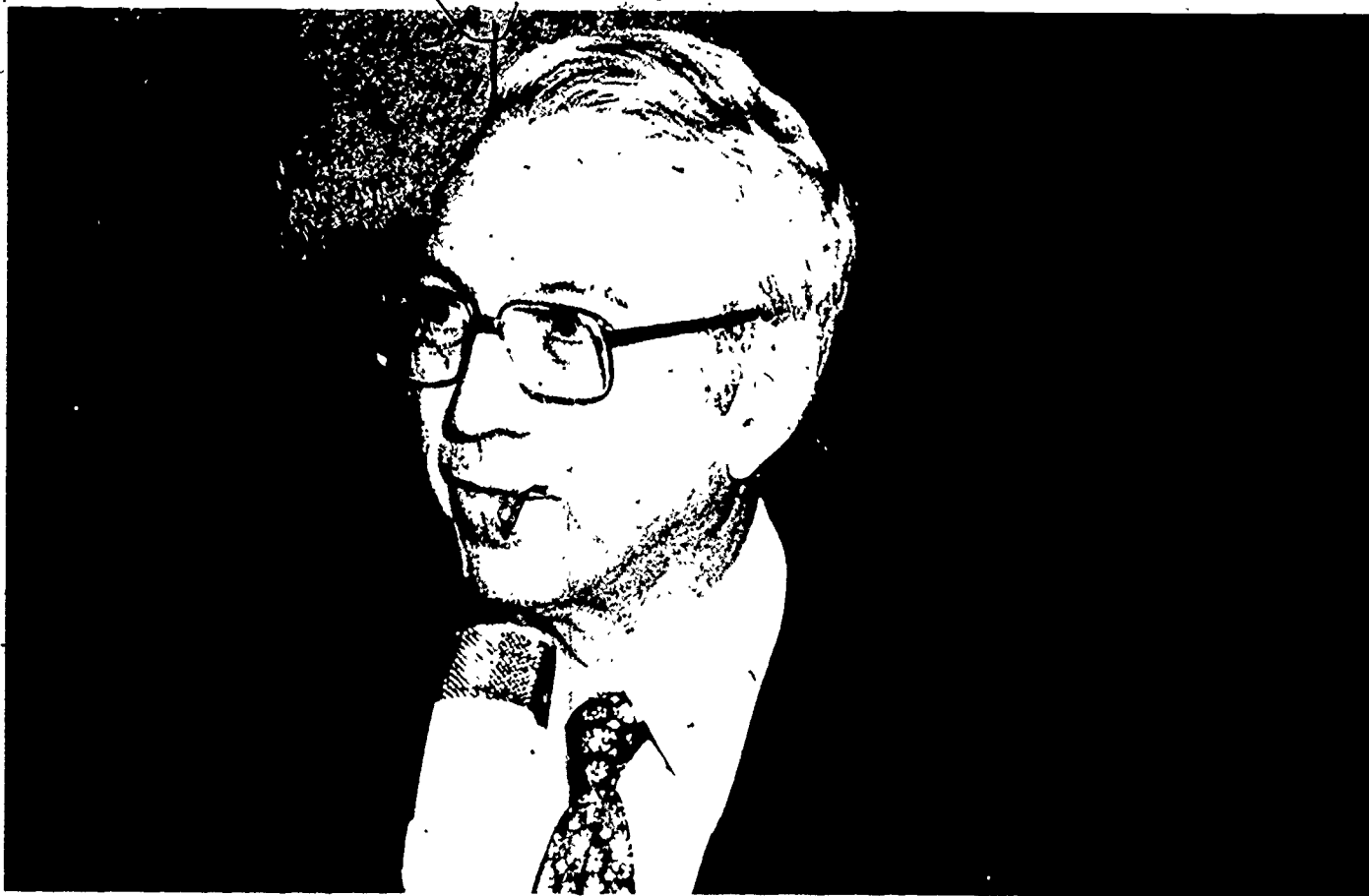
William Block, publisher of the Pittsburgh Post Gazette and vice chairman of the International Press Institute, speaking at the closing dinner of the symposium held in the courtyard of the Mexico City Museum

emotion, historical resentment and ideological and political trends. . . There exists a tremendous and final need for us to coexist. There is a physical coexistence based mainly on mechanical factors, and there is another kind of coexistence based on promoting points of confidence, minimizing differences, eliminating injustice and really looking for an integrated coexistence. I think this is the main task of our new history.