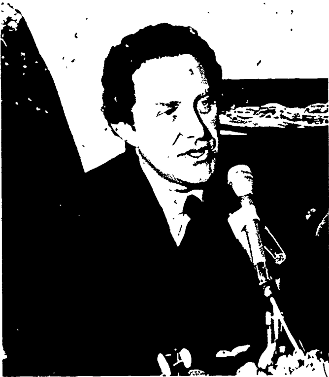
Ambassador at large Robert Krueger United States coordinator for U.S. Mexican affairs