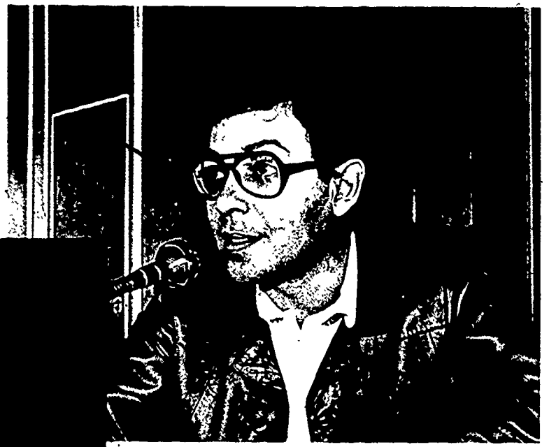
Hector Aguilar Camín, columnist, UnoMasUno, Mexico City