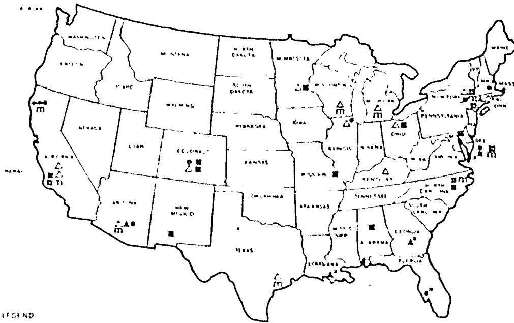
Participation In AMWA's Six National Leadership Workshops 1977-1981 by Medical School by State