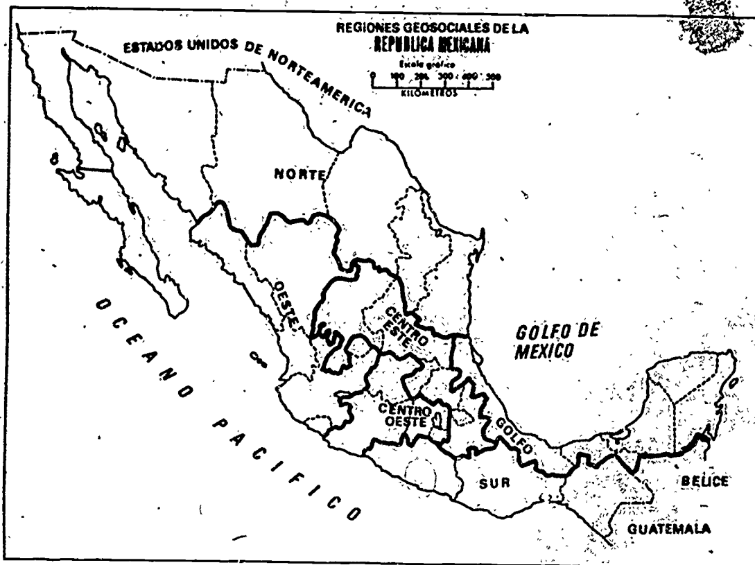
Map 1. Geo-Social Regions of Mexico