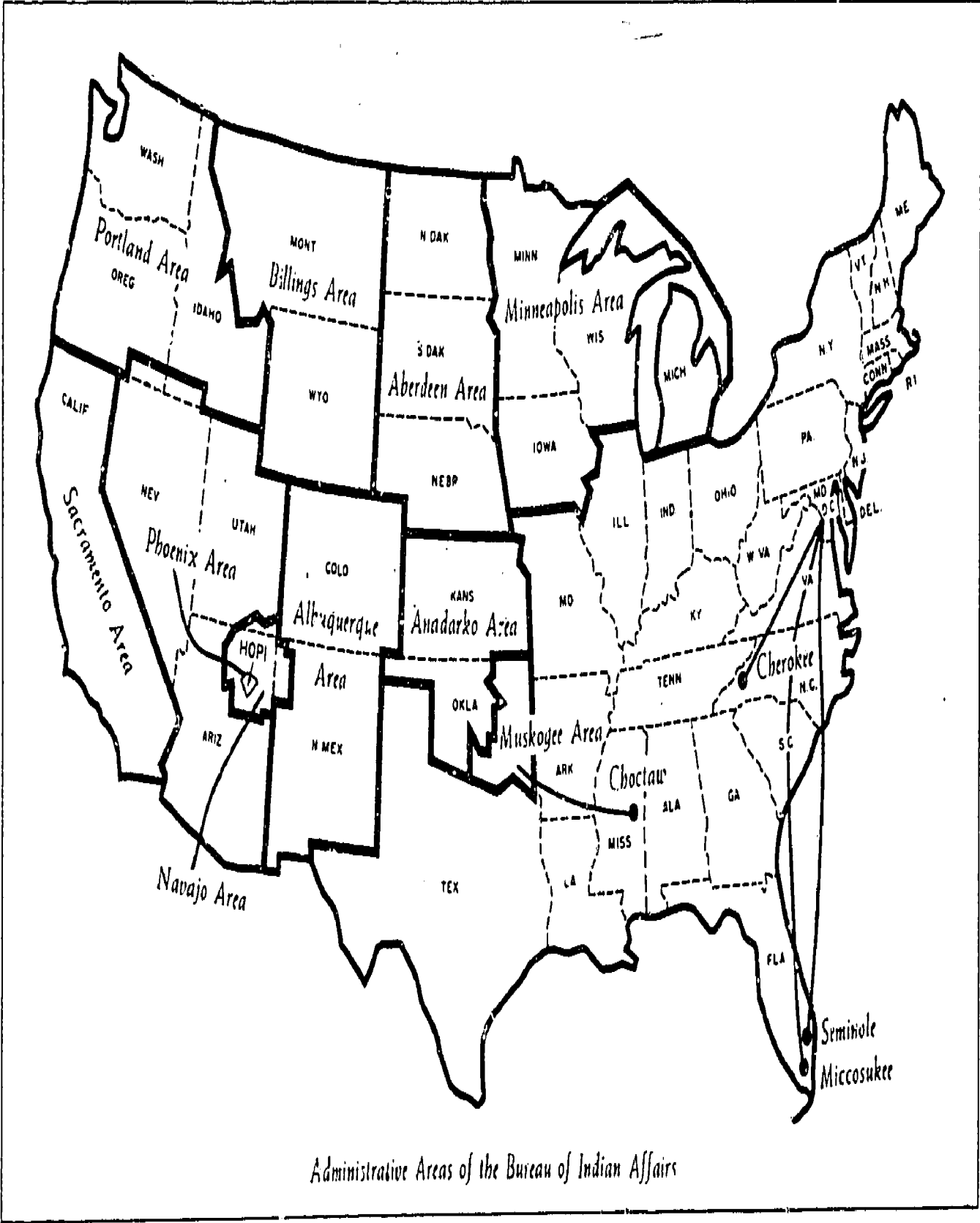
Administrative Areas of the Bureau of Indian Affairs