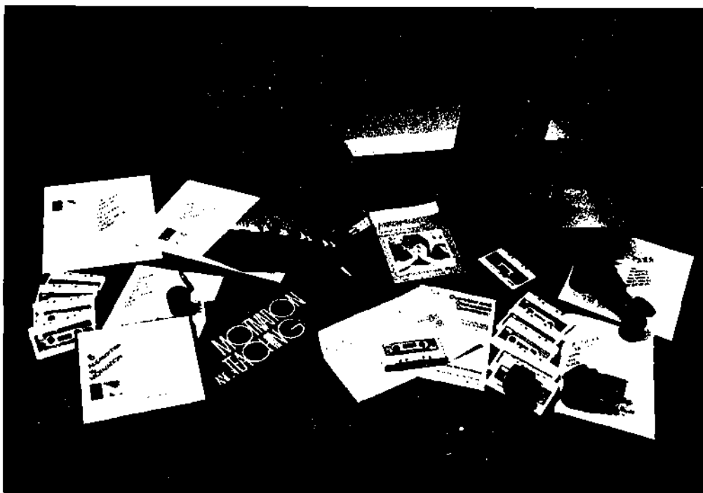
Figure 3. Illustration of a "Product"

In its most complete form, the package would be literally that: a box containing recorded lectures accompanied by films that demonstrate the application of theoretical material, as well as all the ingredients for evaluation, classroom-oriented observation, and group discussion topics that have been previously used and worked out in ongoing programs.