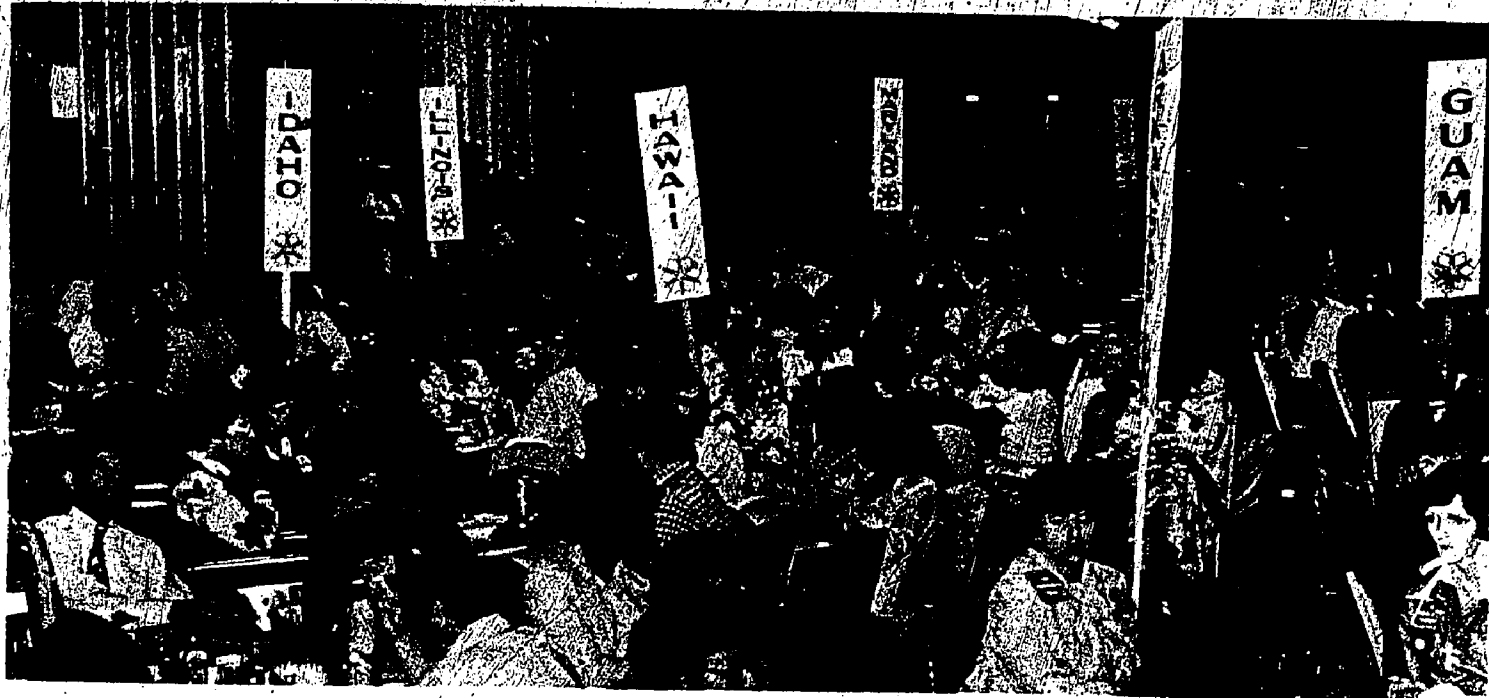
White House Conference on Handicapped Individuals, May 1977.