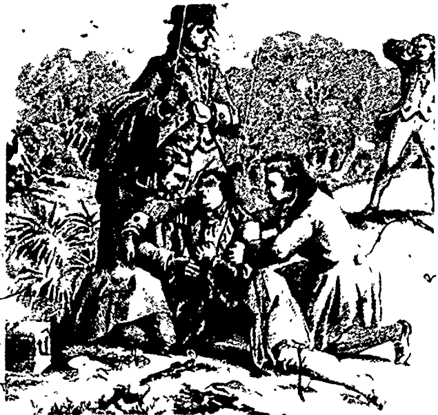
Duel between McIntosh and Gwinnett