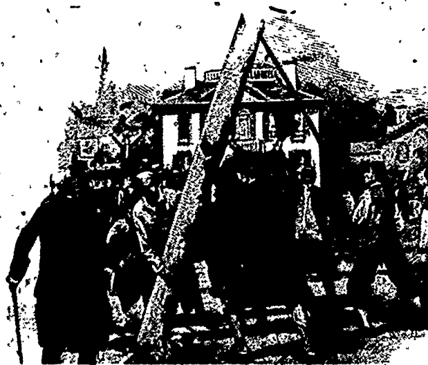
The Liberty Boys

Artist's sketch from Stories of Georgia , by Joel Chandler Harris, 1896.