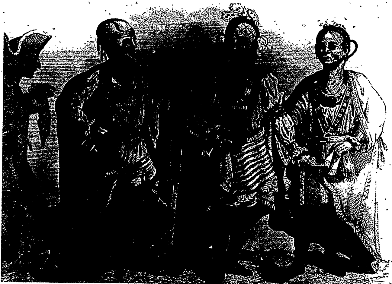
Three Cherokee chiefs sent to England in 1762

And, there was as simple reason for the absence of native warriors. They were still at home awaiting instructions from the Indian department. At best communications in war are uncertain, and particularly so in a situation like the one existing in Georgia in late 1778 and early 1779. Information might