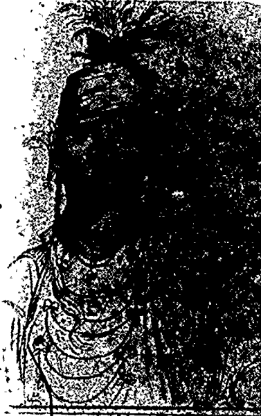
Good Humor of the Cosades Creeks New York July 1790 J.T.