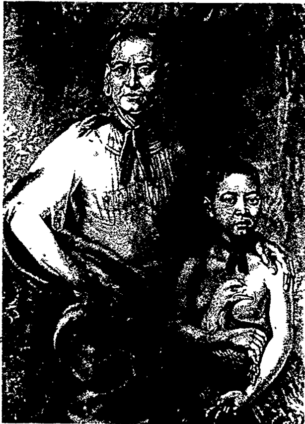
Tomo Chachi Mico (Tomochichi), or King of Yamacraw, and his nephew, Tonahowi

In 1773 the colony of Georgia celebrated her fortieth birthday. Four decades earlier a band of settlers led by James Oglethorpe had sailed up the Savannah River to begin a new English colony. At that time Georgia was created to be a buffer—a protective zone of settlement to absorb the blows of the Spanish, French and Indians who pressed against the southern and western frontiers of England's mainland colonies. From the beginning, Oglethorpe had assumed that the colony's future would be more secure if he dealt fairly and justly with the Indians to whom the area belonged.