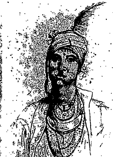
The Woman's Man New York July 1790

shooting near Boston had raised the possibility of war, the burden of organizing an army seemed the first order of business. Then the delegates would have to organize a government. Among the governmental responsibilities was Indian affairs, which was no minor task when one considered the fact that 10 of the 13 colonies had two frontiers, one facing the sea and one the forests. No one could afford to ignore the native Americans, least of all Georgia, whose frontiers lay exposed on three sides, two of them to the Indian country. As one contemporary-observer pointed out, "to the west and almost down upon the Georgia line are the most / numerous tribes of Indians now in North America, viz. the Creeks, Cherokee, Choctaws and a number of small tribes in the whole at least 15,000 gunmen."