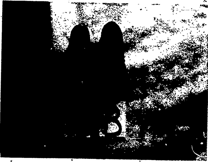
Figure 1 Different Cleat Arrangements for Field Hockey Shoes