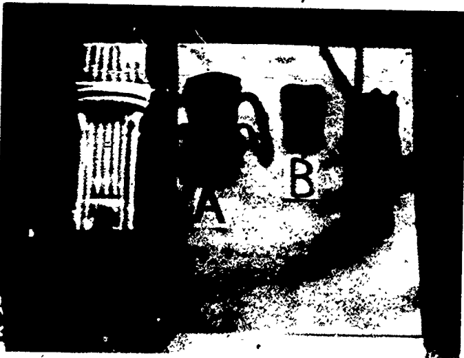
Figure 2 Field Hockey Equipment: A. Shin Guard with Straps, B. Shin Guards without Straps, C. Goalie Pads D. Goalie Kickers