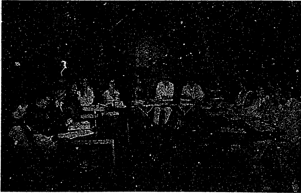
Council-sponsored consultation in Santa Fe, New Mexico.