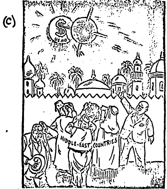
ECLIPSE OF THE SUN