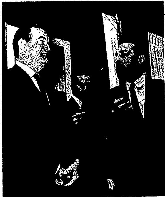
Secretary of the Interior Stewart L. Udall, right, discusses a point of the President's Message to Congress on American Indians with the Vice President Hubert H. Humphrey at the Department of the Interior.

—I am requesting $3 million in Fiscal 1969 for college scholarship grants, to include for the first time living allowances for Indian students and their families to help capable young Indians meet the costs of higher education.