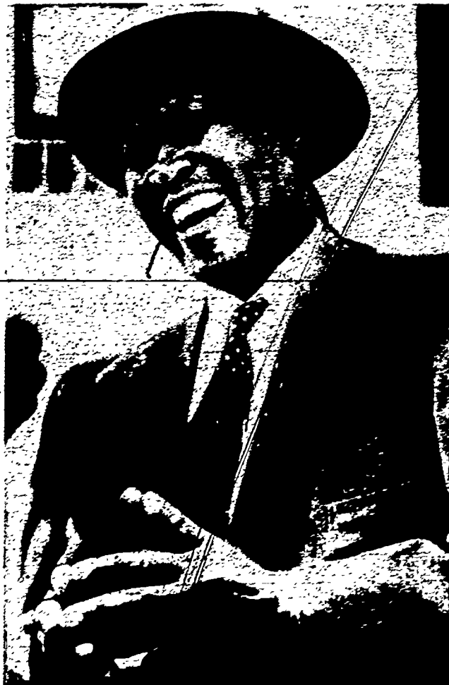
Chief Albert John Luthuli.