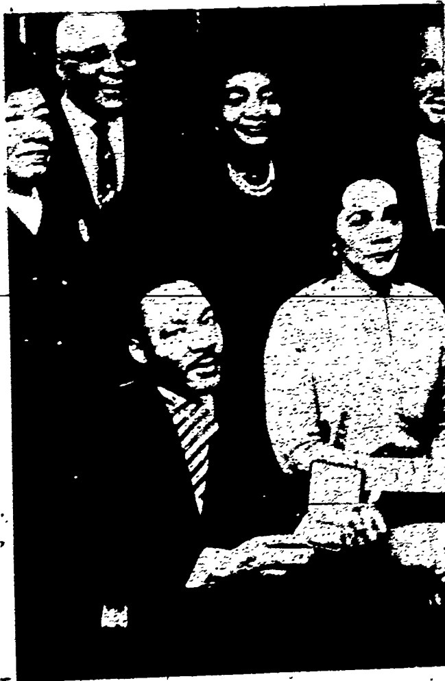
The Reverend Martin Luther King, Jr. photographed with his family, on the occasion when he received the Nobel Peace Prize