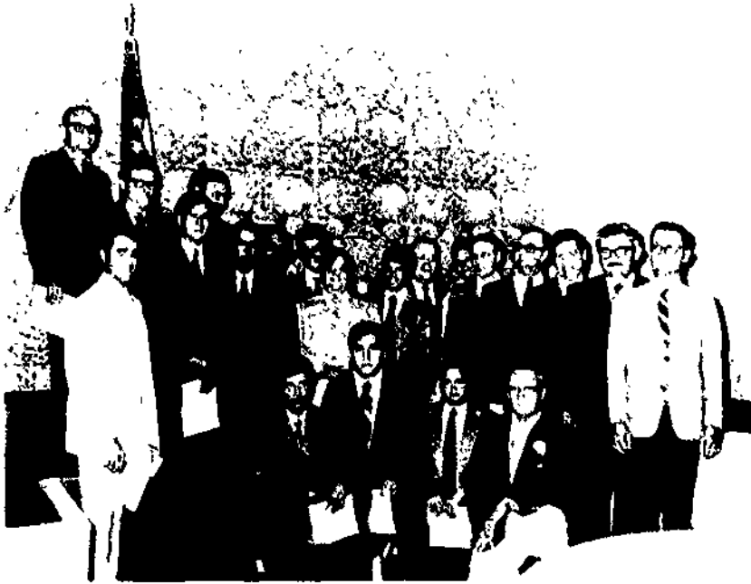
This group of teachers was recognized for five years of service in 1973. The five- and ten-year groups were always the largest in numbers.

The experience provided by the Agricultural Education Society and its forerunner, Townshend, also prepared future teachers for OVATA membership.