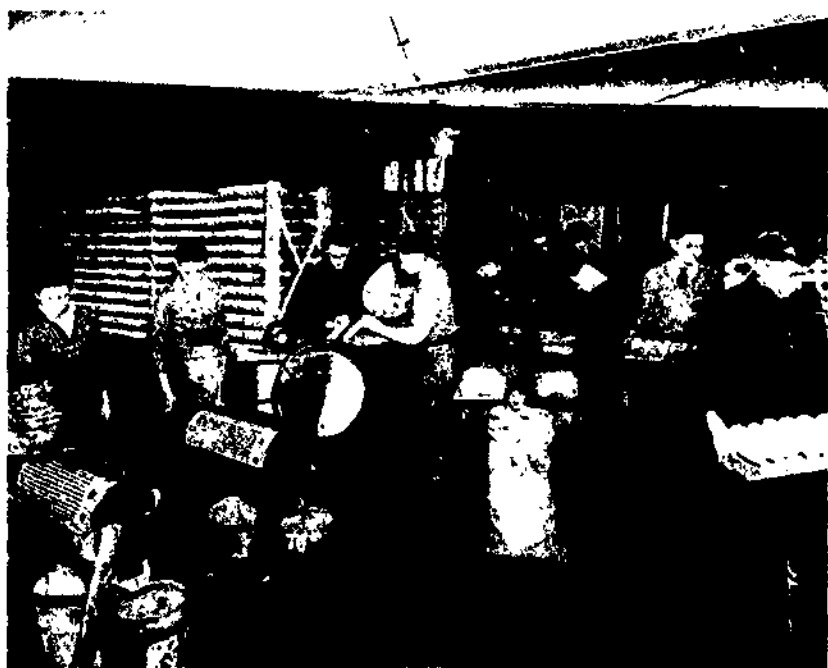
Testing seed corn was a popular vocational agriculture community service project in Watdo.

The Ohio vocational agriculture teachers adopted the Illinois plan of having a permanent organization of 11 districts with chairmen who, with the officers, constituted the Executive Committee. Two meetings were held per year, one during the school year and one during Summer Conference. A Constitution for the Ohio Association of Vocational Agriculture Teachers, later the OVATA, was apparently developed at this time. A copy, (see Appendix on Page 185) was filed in a 1926 folder. It bears the names of six men who were vocational agriculture teachers at