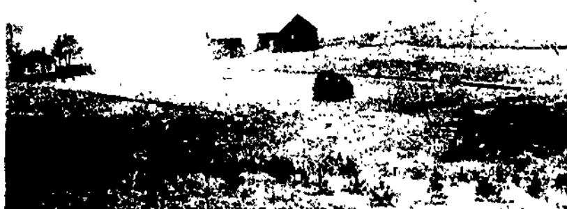
One hundred and ten vocational agriculture teachers and staff members transformed this set of farm buildings into an FFA Camp, capacity 115.