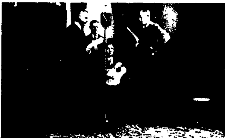
Minerva FFA Chapter had a regular radio broadcast over station KDKA in Pittsburgh, Pennsylvania, in 1929.