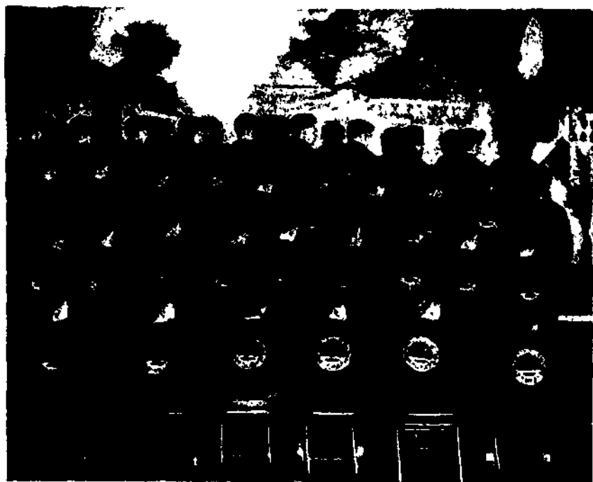
The Fredericktown FFA Band, designated as the official band during the 1933 National FFA Convention, shows off the FFA jacket with emblem designed by Adviser J. H. Lintner.

One thousand and seventy-eight students elected Farm Accounts -- 714 completed them; 645 ton litters were produced by Ohio Future Farmers. (A ton litter is recognized when a ton of pork is produced from one litter in six months.)