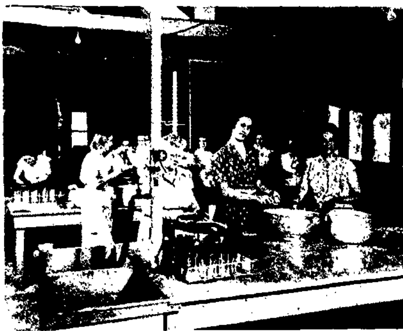
One of the many Food Canning Centers established by vocational agriculture teachers during the war to preserve much-needed food.

Food for Victory Program , also known as Good Production War Training resulted in 8000 farm machines being repaired under the supervision of vocational agricul-