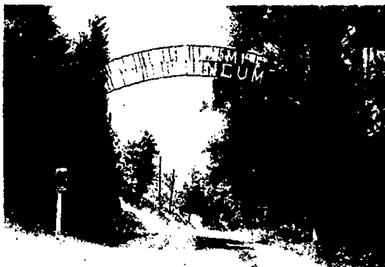
Entrance to the "new" FFA Camp, formerly a National Youth Administration camp, taken over in 1944, thanks to the Muskingum Conservancy District.