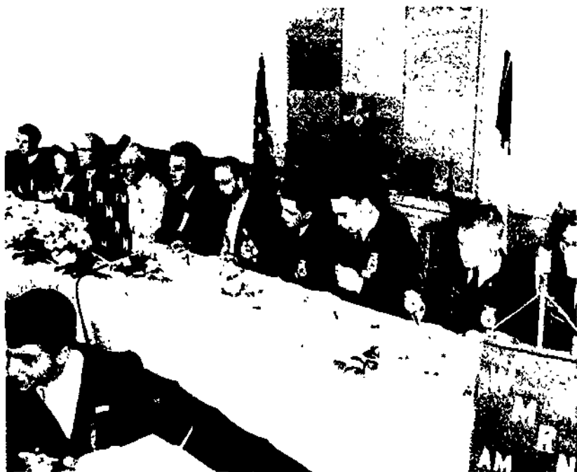
WMRN Marion initiated the FFA Honor Luncheon and Broadcast in 1945 and continued it for 25 years. Gov. Frank Lausche addressed this 1956 event.