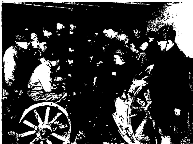
This tractor course at German town was one of the early ones.

cooperation with representatives from the Townshend Agricultural Education Society.