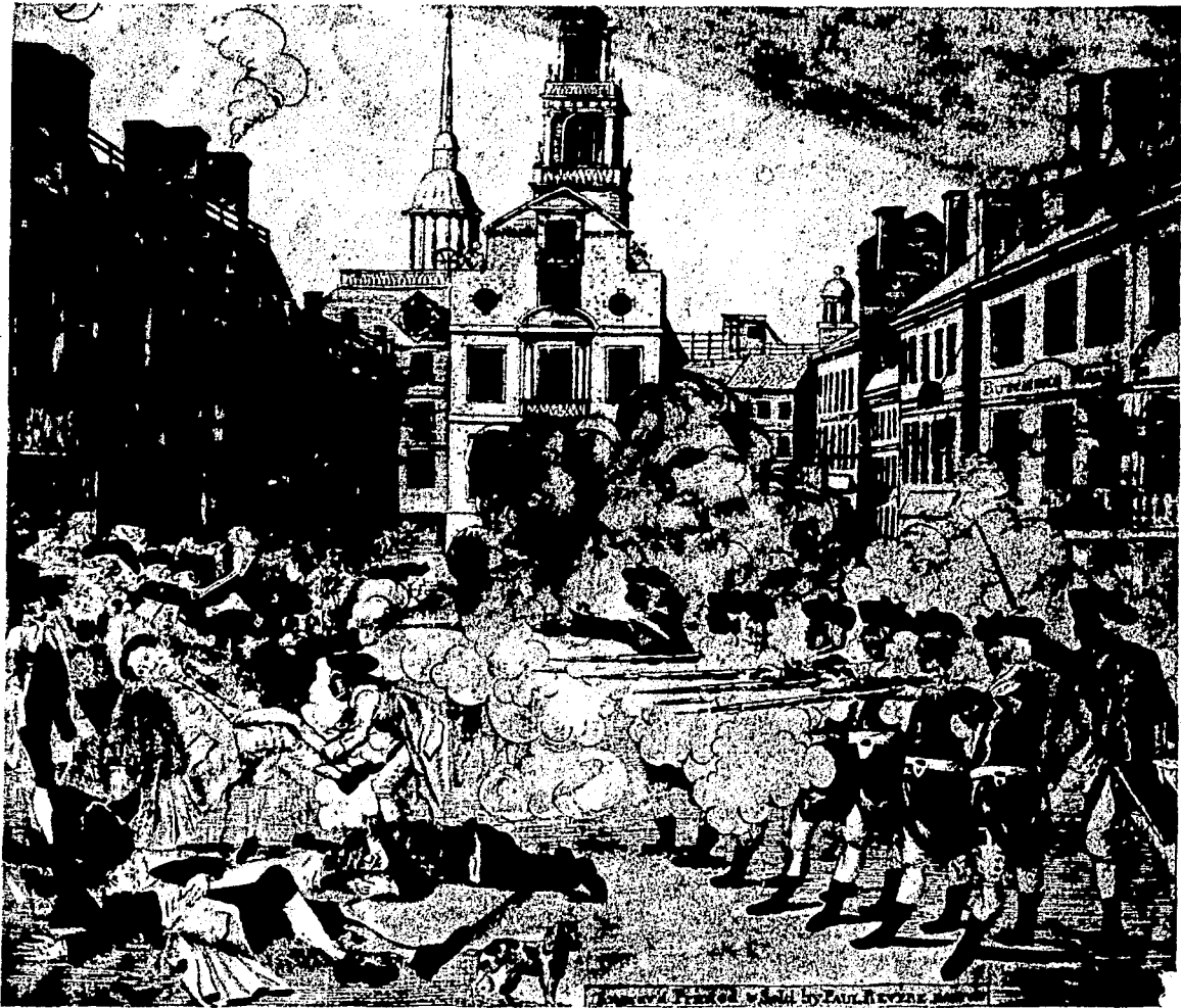
Paul Revere, Metropolitan Museum of Art