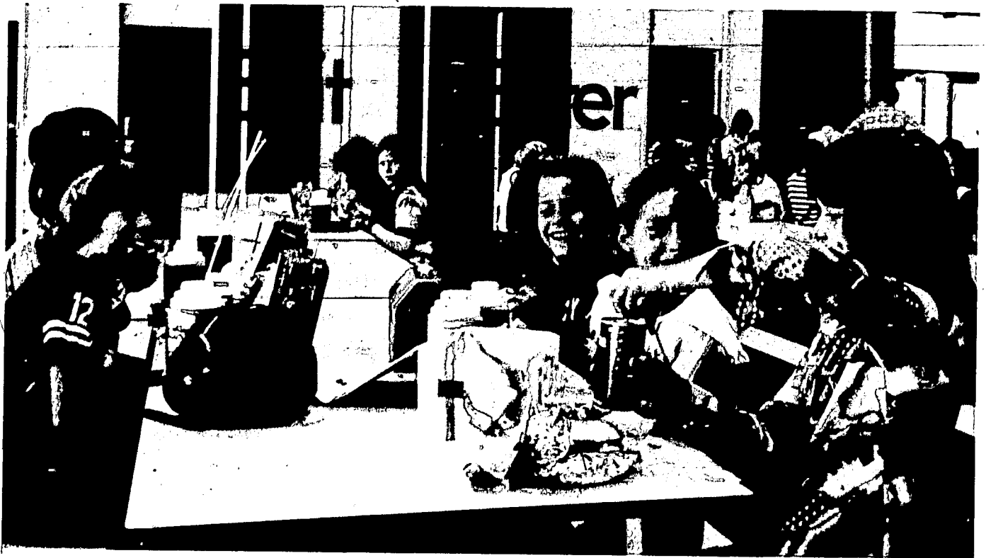
W D Wilkerson Intermediate School, Conroe (Texas) Independent School District. Photo courtesy of Golemon & Rolfe, Architects.

Because educational planners have not found trend analysis procedures adequate for changing systems, Carrs proposes a multiregression model for enrollment forecasting. Tested against historical enrollment data, the proposed multiregression model could account for 99.49 percent of the variance of the criterion variable. This application is similar to a moving-least-squares model.