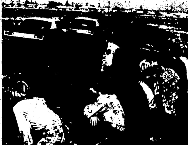
Learning occurs in a variety of settings other than the classroom.

Career preparation is here used in the broad context of preparation for a wide variety of jobs ranging from semiskilled occupations to the professions. This component is designed to ensure (1) that students leaving the secondary school have specific salable skills necessary to enter and succeed in an identified occupation(s); or (2) that they have reached a predefined competence level enabling them to enter further career preparation at another institutional level, such as a technical trade school, junior college, or college. Career preparation embraces four areas: