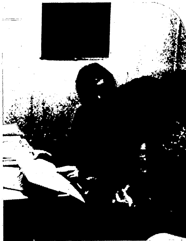
It is necessary for career education—particularly the guidance, preparation, and placement functions—to be made available to all persons throughout their working lives.