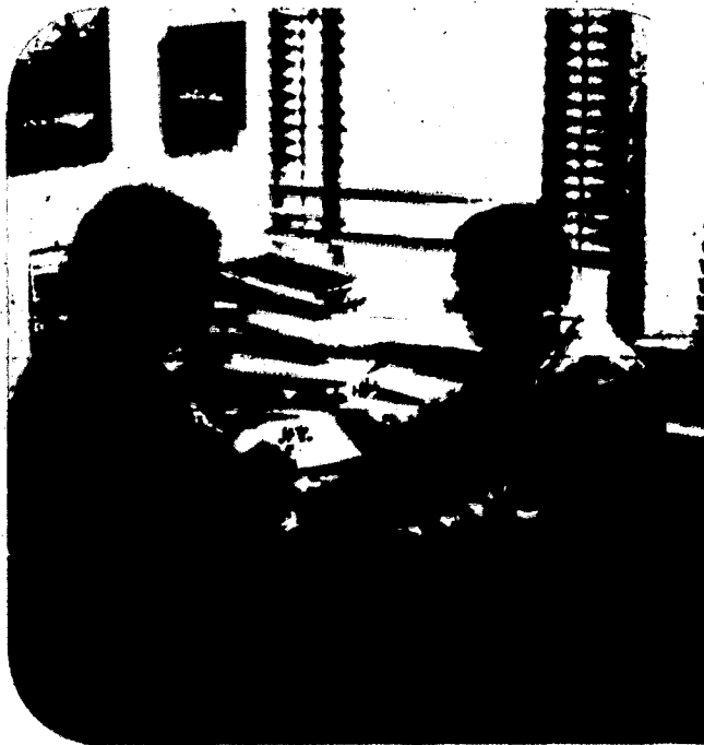
Career decisions should be based upon competent guidance and concerted program design—not upon chance.