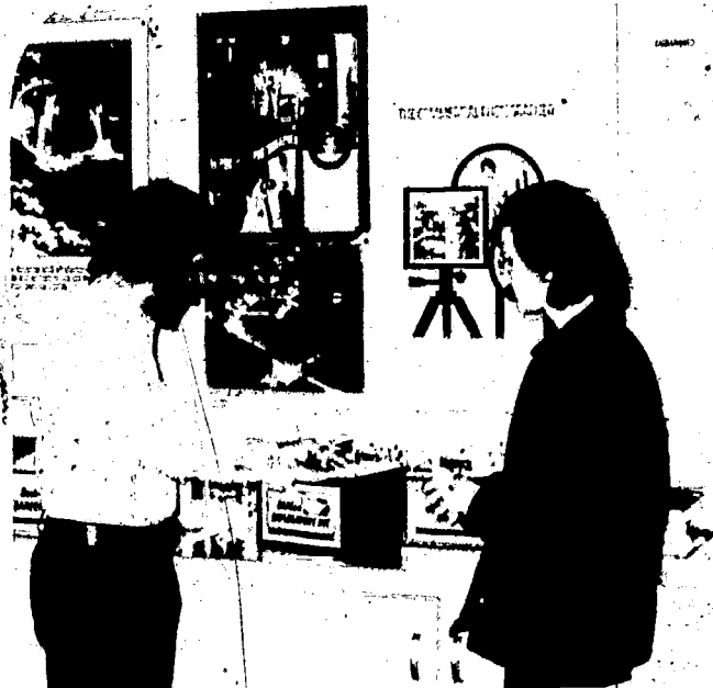
A student learns about the wide range of available career options.

The U.S. Office of Education has developed a cluster scheme covering 95 percent of known jobs.