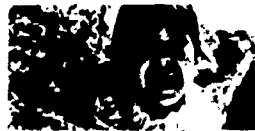
FACIAL EXPRESSION STIMULUS