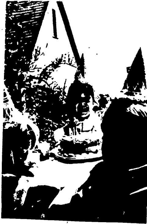
CONGRUOUS CUE PICTURE