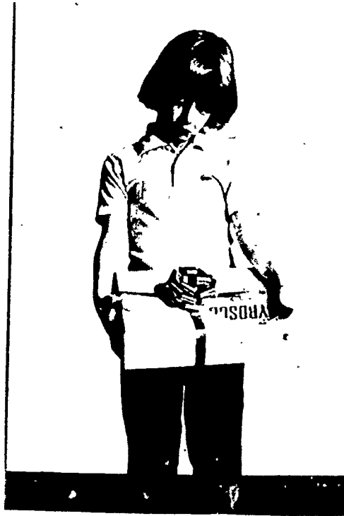
INCONGRUOUS CUE PICTURE