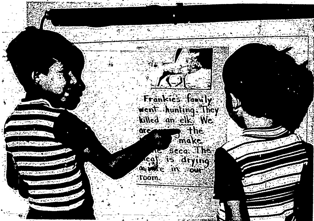
Spontaneous peer tutoring is often seen in classrooms, as in this case where one child is helping another child read a door chart.