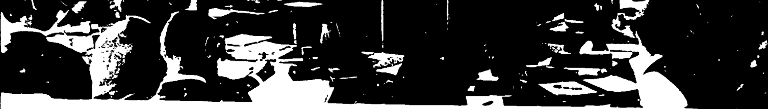
Participants at the Conference Table