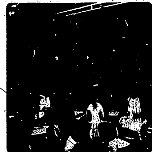
Sharing findings with an audio-visual presentation