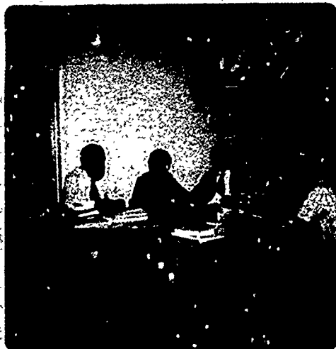
Staff planning a new developmental program