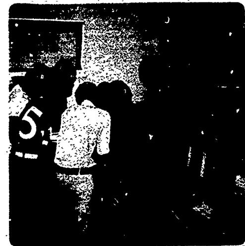
Examining collected information