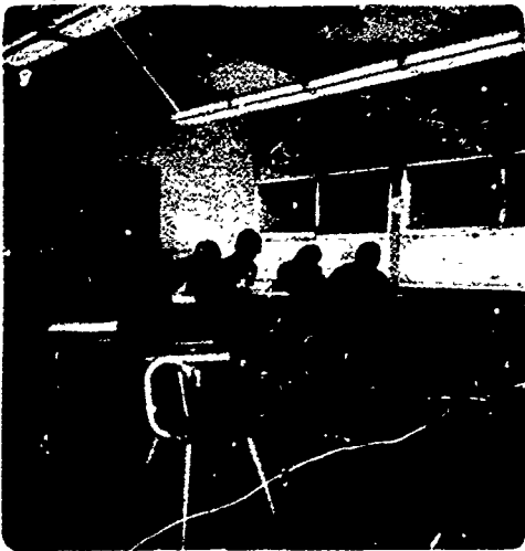
Compiling research data