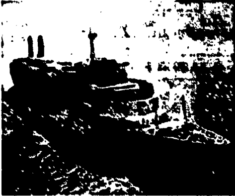
PaO's Canberra sails for the Far West, France and England in July.