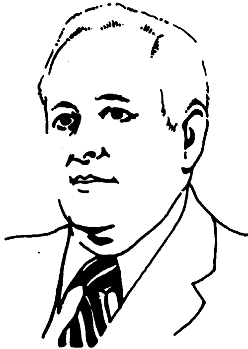
WILLIAM A. EGAN, GOVERNOR

Under Alaska's Constitution, the governor is empowered to name the heads of all departments and the membership on boards and commissions, subject to confirmation by the legislature. There are sixteen principal departments: Administration, Commerce, Community and Regional Affairs, Economic Development, Education, Environmental Conservation, Fish and Game, Health and Social Services, Highways, Labor, Law, Military Affairs, Natural Resources, Public Safety, Public Works, and Revenue.