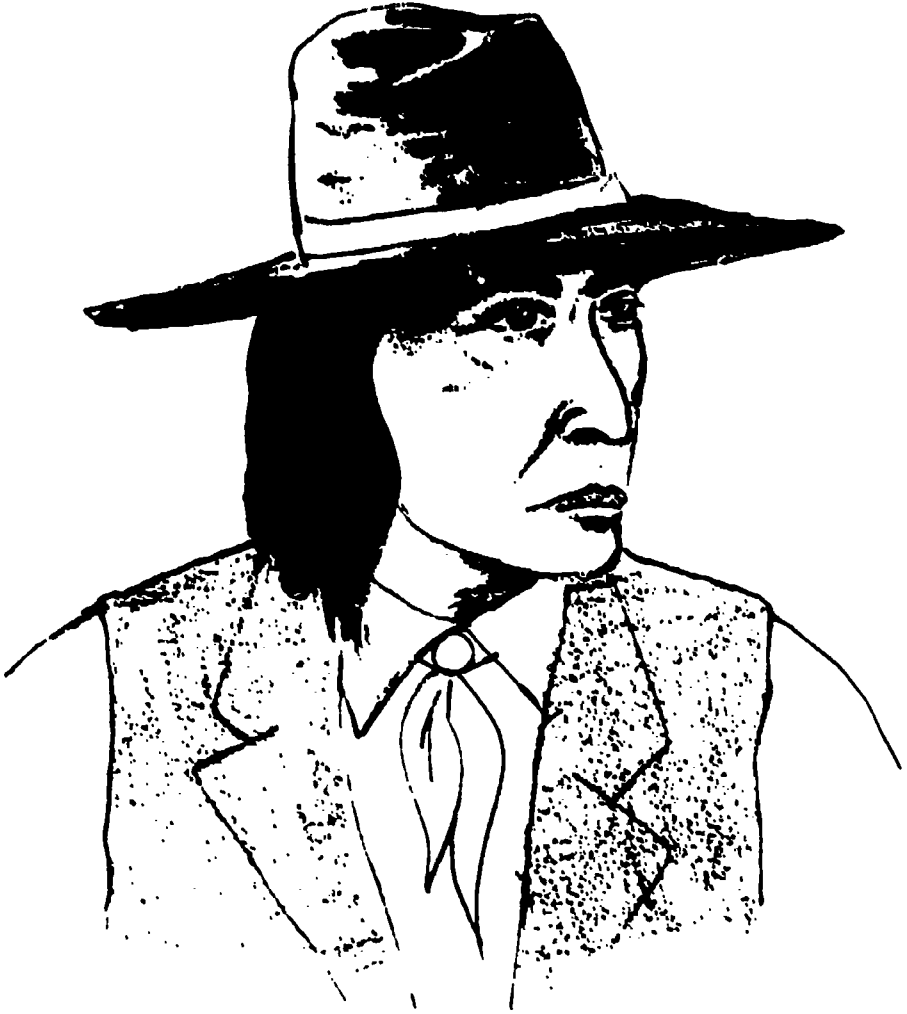
CHIEF WHITE EAGLE