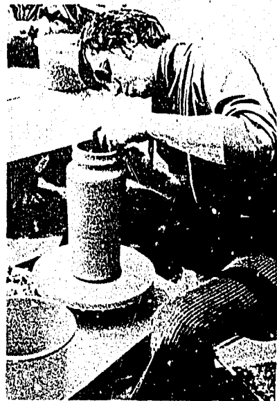
Potter demonstrates the use of the potter's wheel.

An audible sigh of relief went up from the Boulder Experimenters. Less than a month before the scheduled dates of the fair, and all their efforts since November had almost gone down the drain!