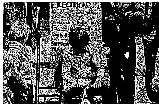
A youngster tries out the electric car built by a group of students at the University of Colorado.