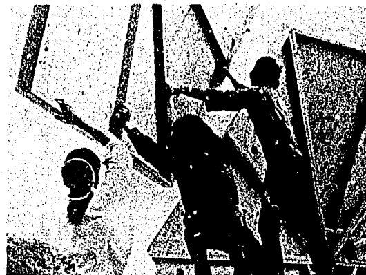
Putting a section of the 39-foot geodesic dome in place.