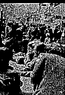
Participants in a discussion group listen attentively while the fair-goers mill about them.