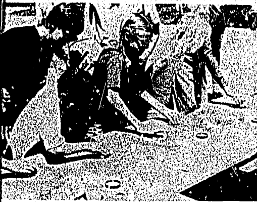
...ding glass at the glass recycling exhibit put up by a group from Colorado School of Mines.