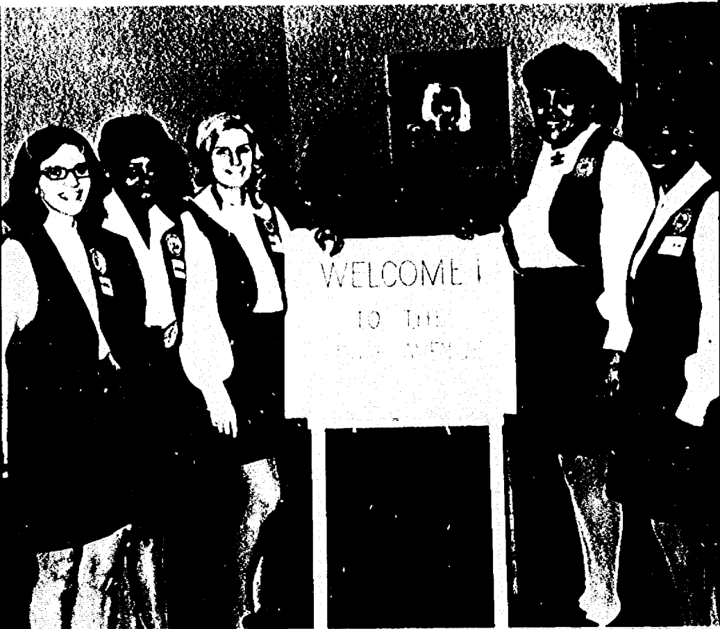
The Dale Avenue Tour Guides