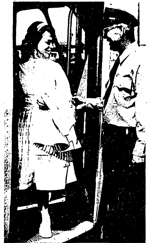
A bus driver should maintain a business-like yet friendly relationship with students but avoid becoming personal. A friendly smile does wonders in promoting a happy atmosphere.

24. Defiance to established procedure comes from failure in some adult to keep the situation in hand. If there is danger of a direct break, the child should not be forced. An adult's will should never be pitted against that of a child. It is far wiser to give some simple directions that will be mechanically