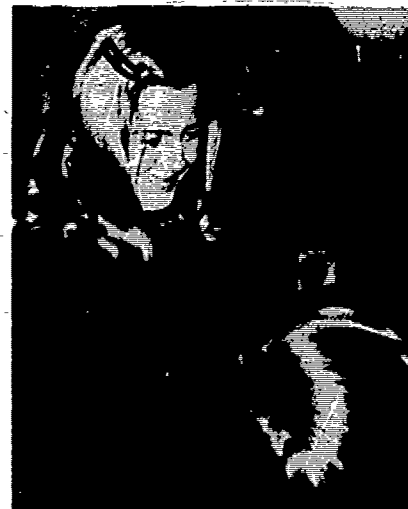
At the City Library, students help patrons with a variety of problems and questions