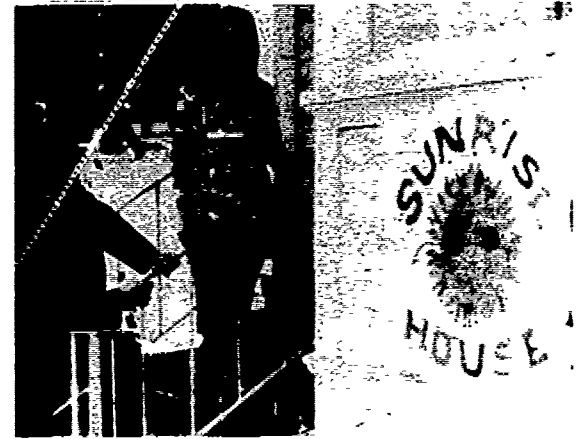
Hearing about activities of the drug abuse center, Sunrise House.

In contrast, students felt their least significant experiences were those in which