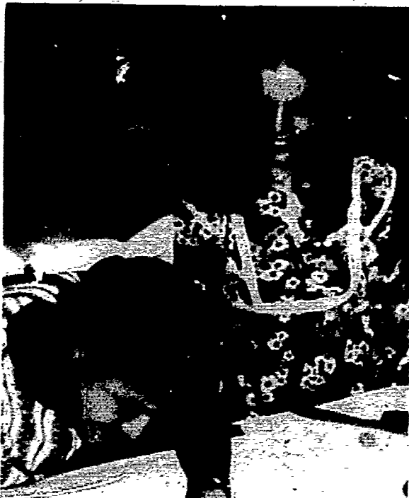
Constructing a block plan in the County Planning Department