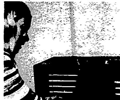
One of the activities of the City Personnel Office is its communication service