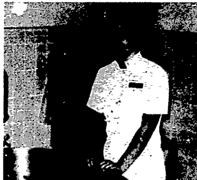
Students working with the Public Health Department often serve in one of the public clinics