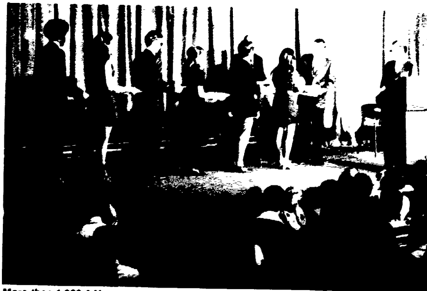
More than 1,600 4-H members attended the 50th Anniversary of National 4-H Congress in Chicago where President Nixon spoke and presented awards.