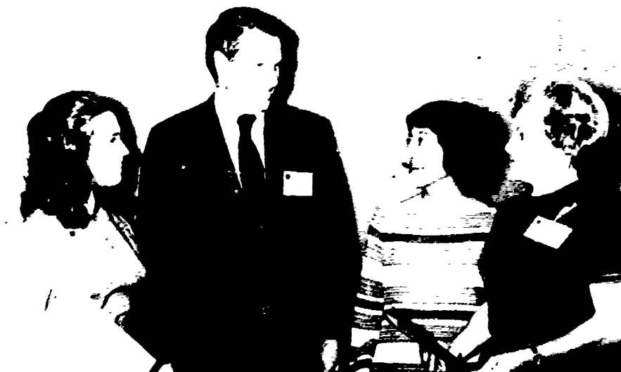
Leaders from Maine to Hawaii and Alaska to Florida attended Fall meeting.

In November, 1970 all of the Directors of the Cooperative Extension Service and the Executive Committee of the National Association of State Universities and Land Grant Colleges endorsed the program of Staff Development and Training, recognizing the "importance of the National 4-H Center expansion and the foresight of Extension leadership in planning for effective use of this facility."