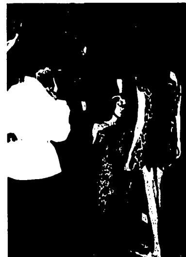
Developing the human element.