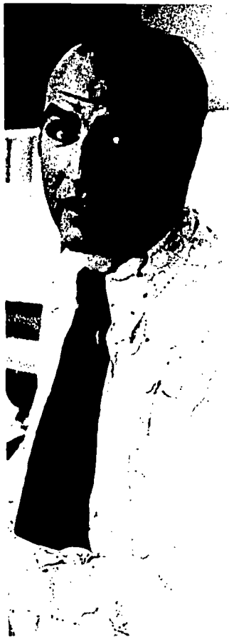
Carnie discusses his approach to education in conventional, non-threatening language.