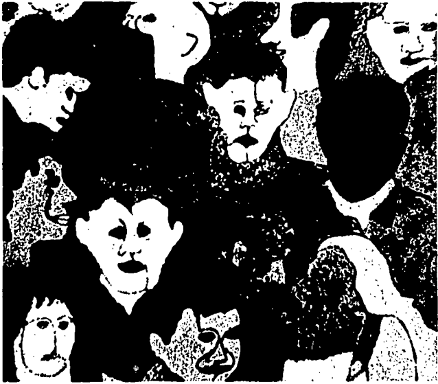
Bringing it together— A mosaic of student faces by Bell students.