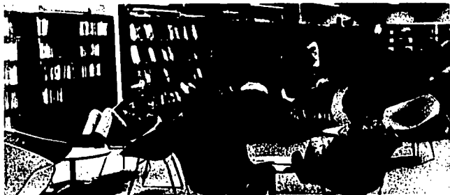
A progressive program in a traditional setting.