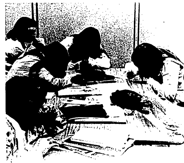
Anyone willing and qualified to assume the responsibility.