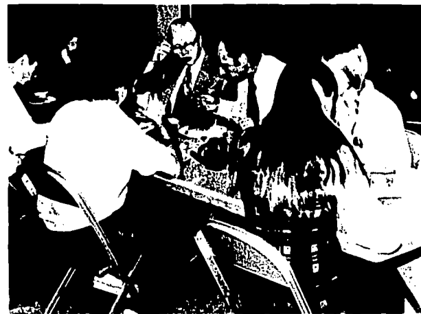
Open communication is essential for improving the school environment—Carnie, staff, parents, and students in the cafeteria.