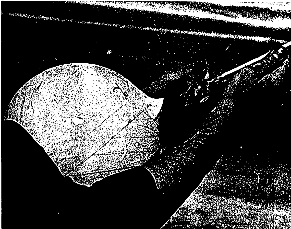
FIGURE 2 - Purging procedure shown using 5-liter flask.