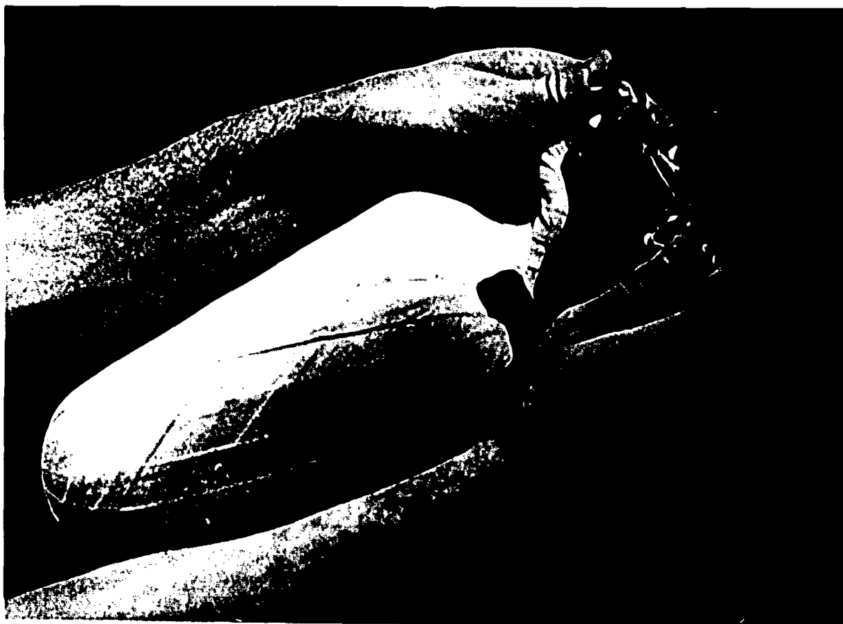
FIGURE 3 - Sampling position with cylindrical flask.