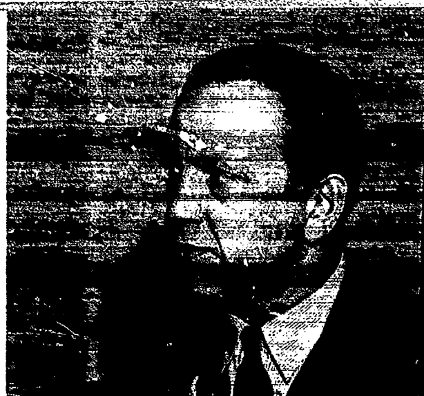
Congressman John Brademas Democrat of Indiana

I am an invisible man . . . I am a man of substance, of flesh and bone, fiber and liquids—and I might even be said to possess a mind. I am invisible, understand, simply because people refuse to see me.