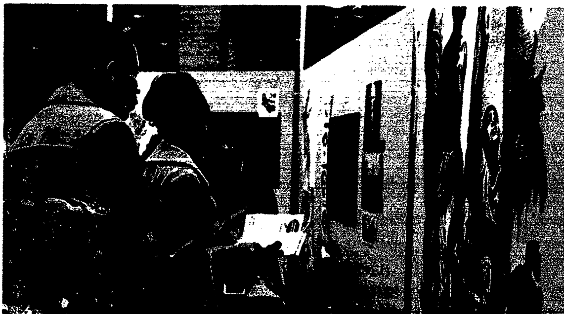
Negro History Week Display, NEA Headquarters Lobby

I'm firmly on the side of "overcompensating" right now. I think the third rail should be in the history books, and I think we should go this way for quite a few years before we begin to taper off. We can get off the hook. There's been enough rationalization. It's time to act now.