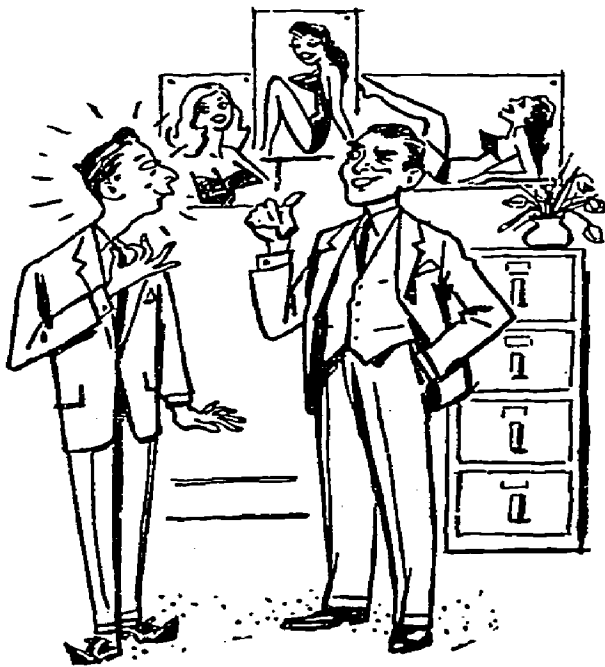
The 'off balance' approach

Don't, however, flourish the application form in front of him and solemnly go through it word by word with him.