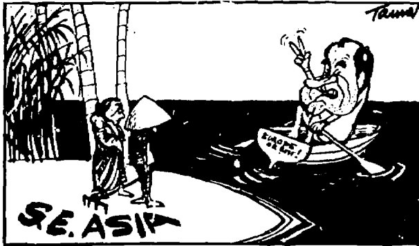
"We aren't going isolationist -- but you are."

This statement by Crosby S. Noyes which appeared in The Japan Times on November 15, 1970 (reprinted from The Mirror , The Ministry of Culture, Singapore, December 7, 1970), lends further support and increasing relevance to our continuing efforts to promote Asian studies in elementary and secondary education.