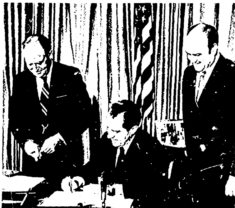
President Nixon signs the Instrument of Ratification for the Nuclear Nonproliferation Treaty. Looking on are Secretary of State William P. Rogers (left) and Secretary of Defense Melvin Laird.

In its report on the treaty, the Foreign Relations Committee stated that it thought the U.S. Government, by offering the resolution and the declaration, had given up an element of flexibility in bringing cases of aggression or threats of aggression to the attention of the Security Council, especially with respect to timing. The Committee observed, however, that if this action results in creating a framework for United States-Soviet cooperation in the United Nations, the "gesture will be worth the costs in diplomatic flexibility."