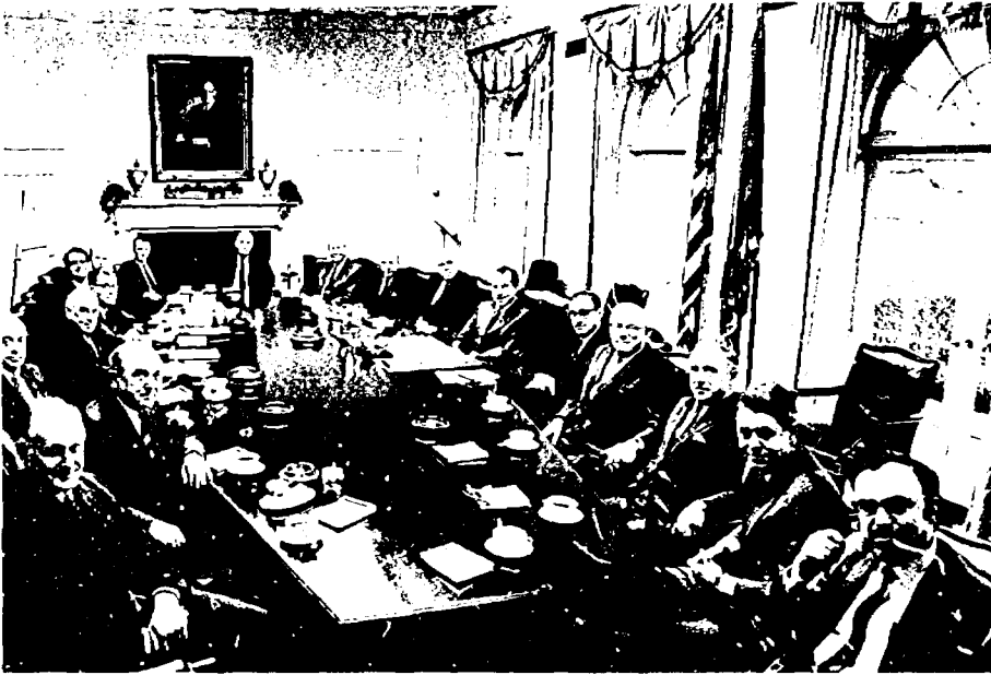
President Nixon Meets With the General Advisory Committee in the White House on December 16, 1969