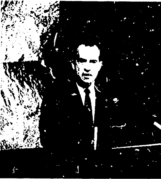
President Nixon addressing the United Nations General Assembly